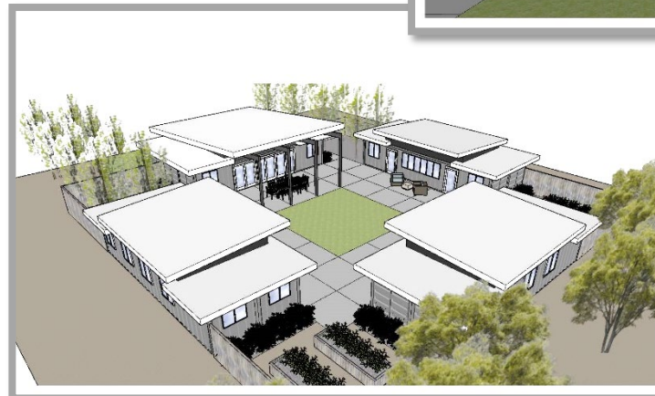
Architectural renderings of Naomi’s House.

Designed to be built using cargo containers.